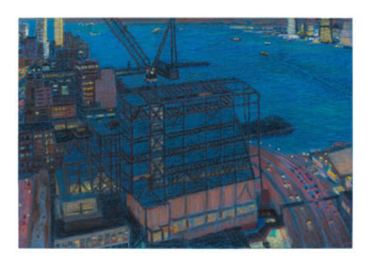
Yvonne Jacquette, "Whitney Museum Under Construction I" (2013), pastel on paper, 19 x 27 1/2 in (click to enlarge)

complex harmonics as fluidly as possible. This impressionistic pastel records the vista's grid-like, stationary forms and the curvilinear movements of the highway and river, its varied pitches of light and dark, and its large-scale constructions and smaller components. The combined natural and industrial shades of blue, gray and red in this initial study form the essential palette from which she will create the larger panoramic oil painting.