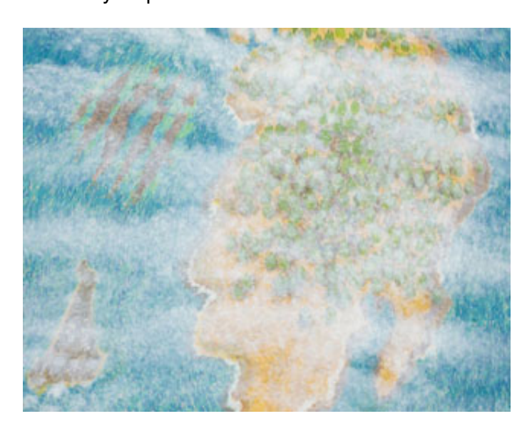
Yvonne Jacquette, "York Island, Off Isle Au Haut" (2013), oil on linen, 44 x 56 in (click to enlarge)

Three of these smaller works, focused on aerial views of Rome, Siena, and San Giovanni, represent an important formal departure for Jacquette. To produce them, she utilizes photographs — archival pigment prints from her pastel studies — as a material base. The images then form a kaleidoscopic collage featuring contravening perspectives and differing angles that hover over the same cityscape.