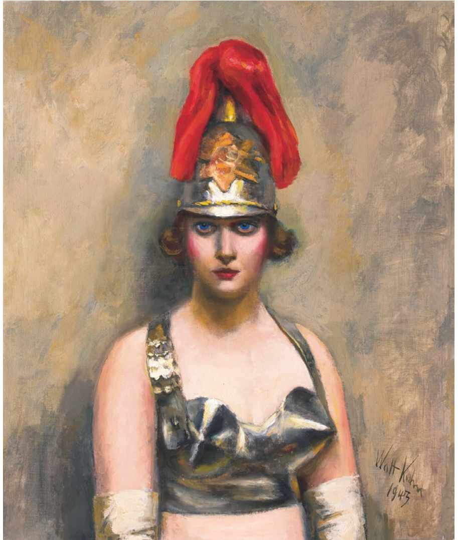
Walt Kuhn (1877-1949), Showgirl in Armor , 1943. Oil on linen, 30 x 25 in.

The following year Kuhn and others formed the Association of American Painters and Sculptors. The association's first exhibition changed the course of modern art in this country. The 1913 International Exhibition of Modern Art became known as The Armory Show because it was staged in New York's 69 th Regiment Armory. It featured 1,300 paintings, sculptures and decorative works by more than 300 avant-garde European and American artists. Kuhn