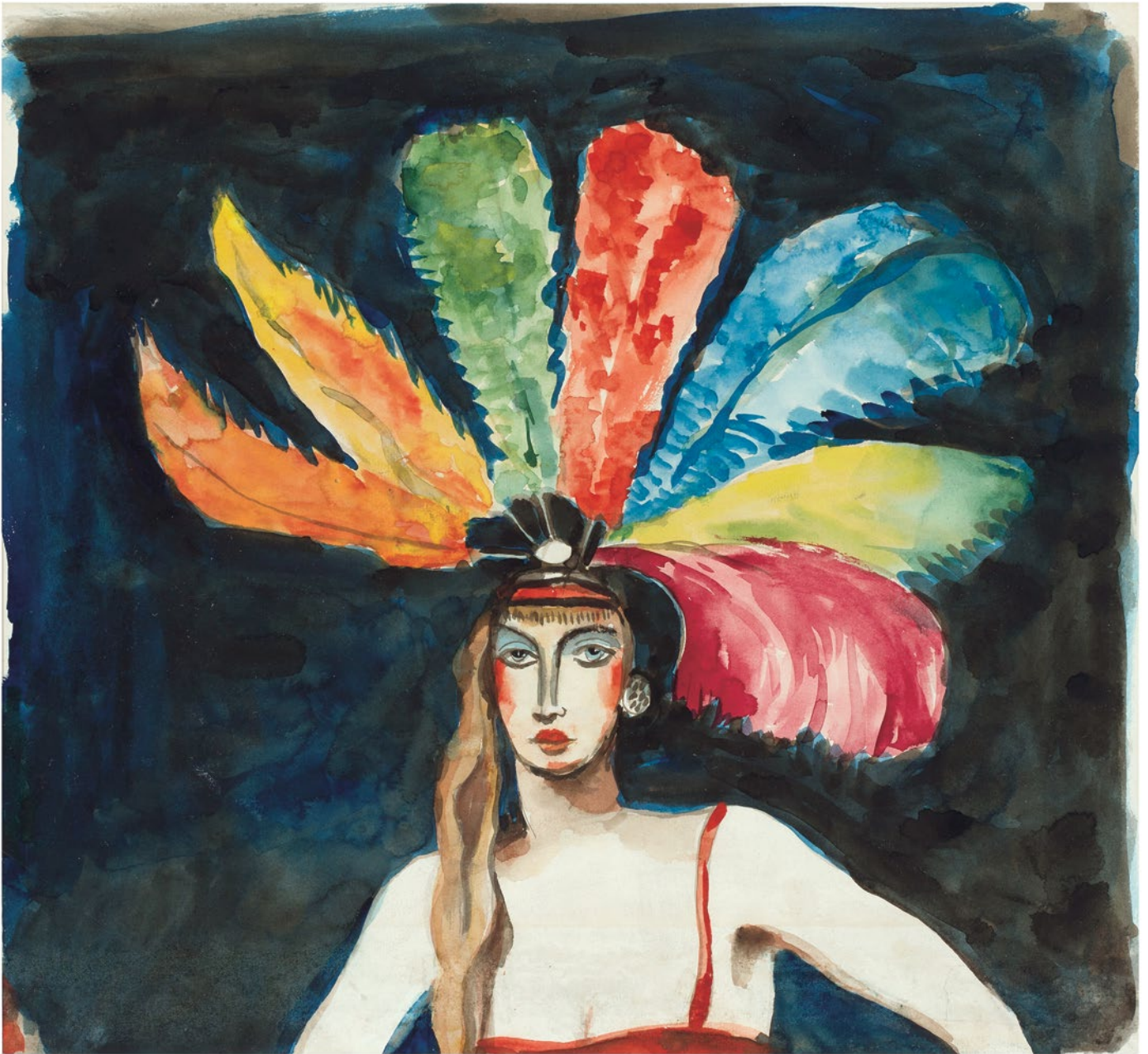
Walt Kuhn (1877-1949), Exotic Dancer , ca. 1926. Watercolor on paper, 15½ x 16½ in.

New York exhibition at the Little Galleries of the Photo-Secession, later known as 291.