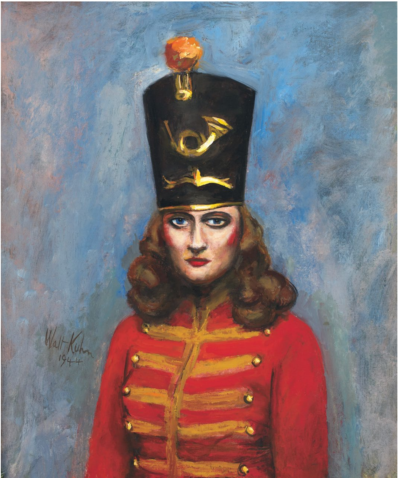
Walt Kuhn (1877-1949), Woman in Majorette Costume , 1944. Oil on linen, 30 x 25 in.

Kuhn's portraits depict his subjects far away from their fanciful performing milieu and isolate them against plain backgrounds revealing the individual personalities behind the makeup with stunning psychological impact.