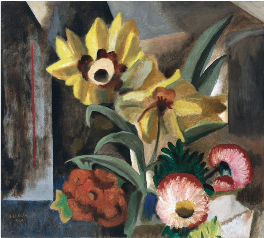
Walt Kuhn (1877-1949), Adventure, 1924. Oil on canvas, 32 x 36 in.

very human personalities, conditioned to specialized jobs in burlesque, vaudeville and circus.”