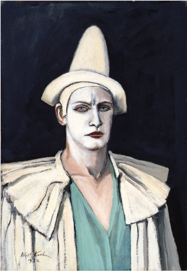
Walt Kuhn (1877-1949), Portrait of the Artist as a Clown (Kansas) , 1932. Oil on canvas, 32 x 22 in.