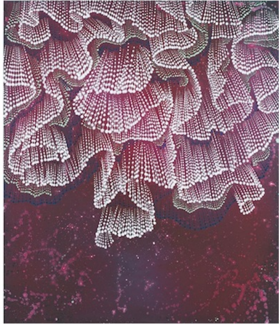
Folds (diptych), 2015, acrylic on linen, 42" x 72"