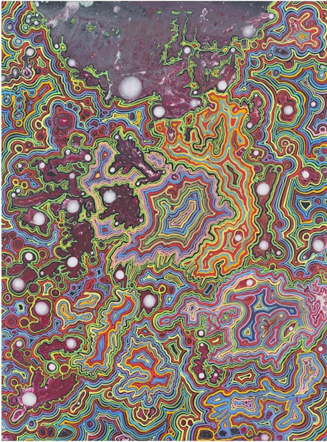
Incognito , 2015, acrylic on wood panel, 16" x 12"