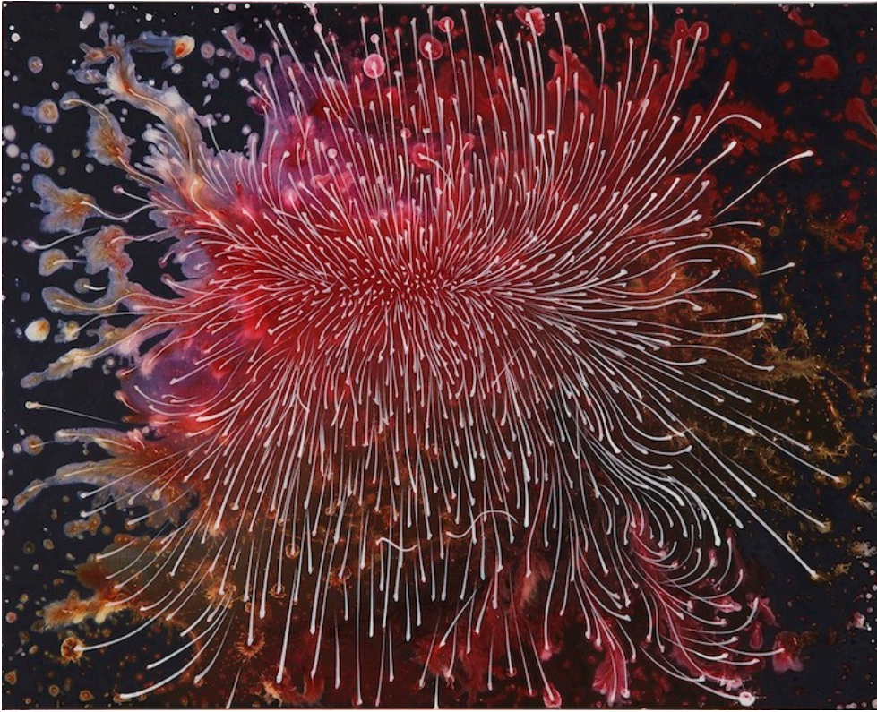
Red June , 2014, acrylic on linen, 16" x 20"