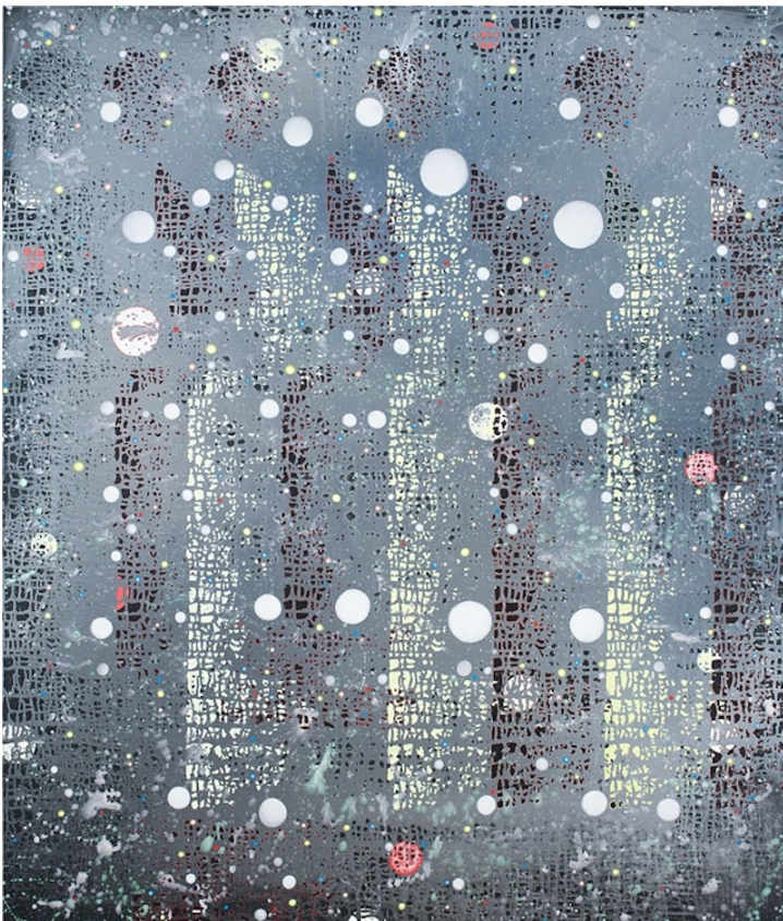
27th Street Tracings, 2015, acrylic on linen, 70" x 60"