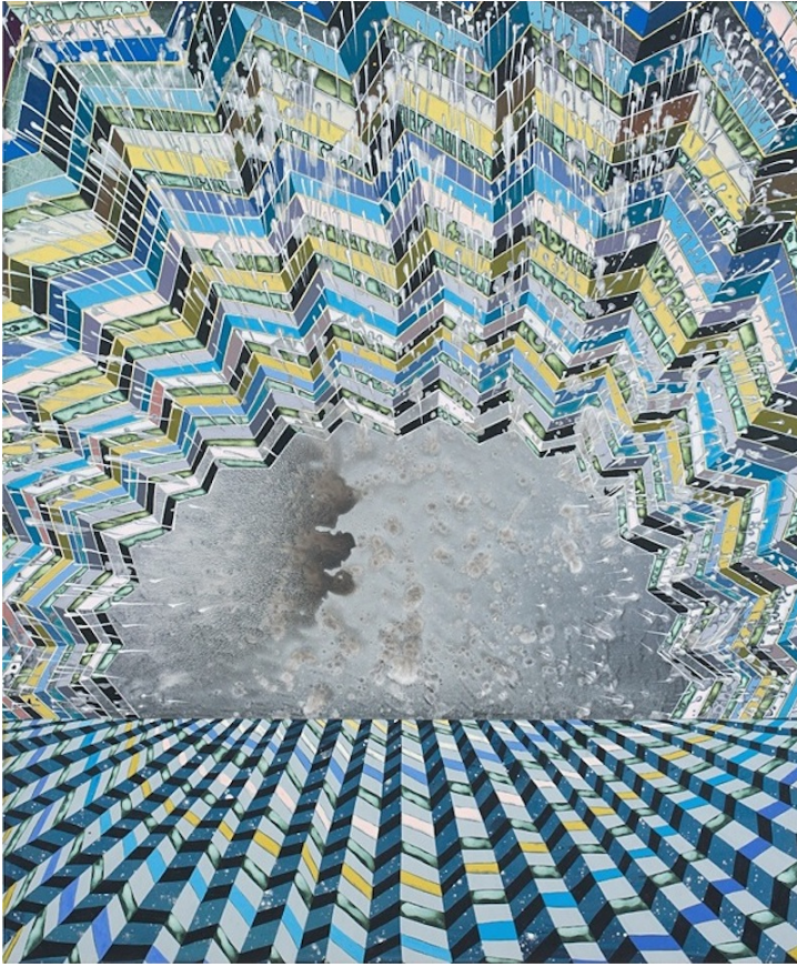
Arc/Arch, 2015, acrylic on linen, 54" x 45"