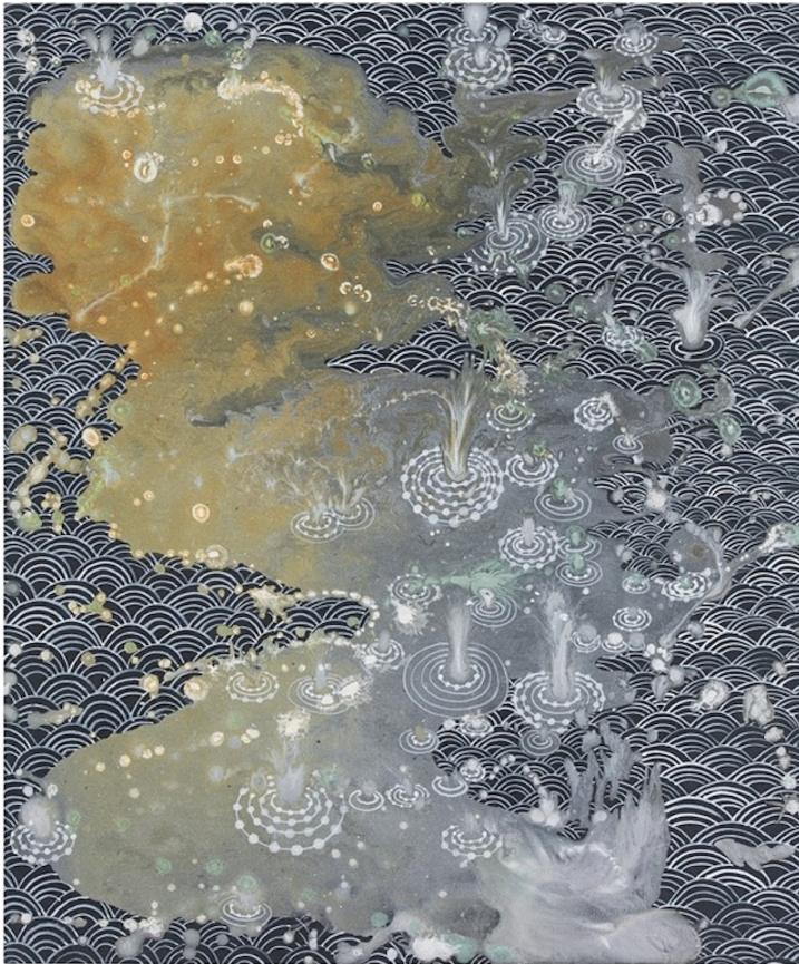
Small Springs , 2015, acrylic on wood panel, 12" x 10"