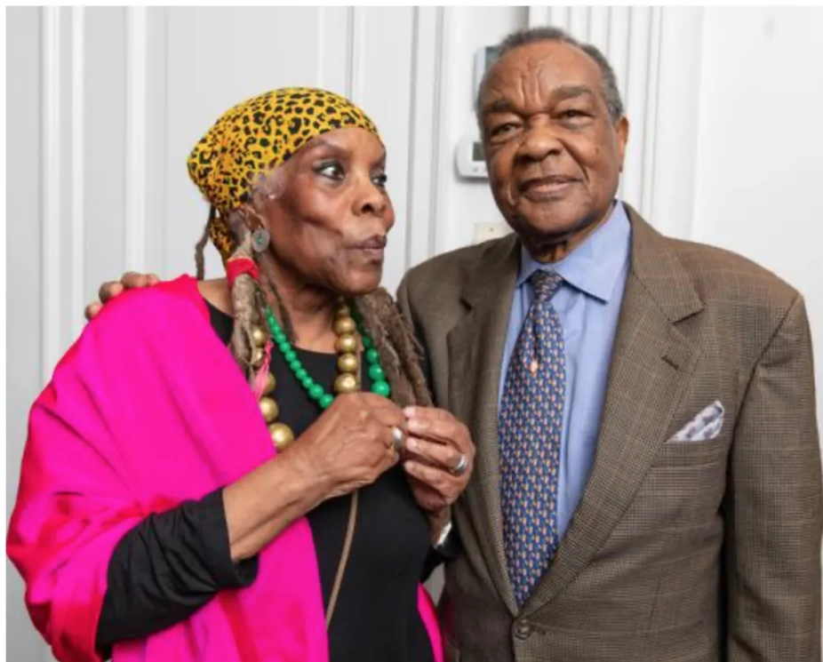
Feb. 6, 2020: Mary Lovelace O'Neal and David Driskell at the opening of “Mary Lovelace O'Neal: Chasing Down the Image” (Feb. 6-March 21, 2020), her five-decade survey at Mnuchin Gallery in New York City.