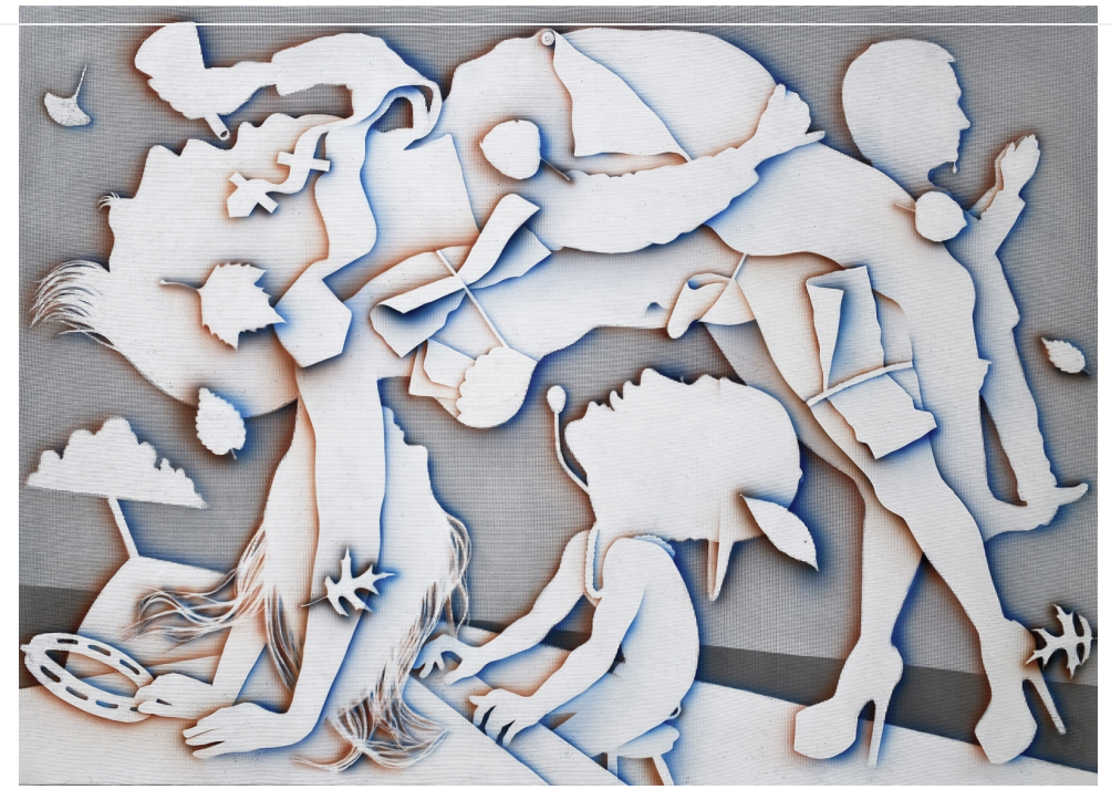
Autumn Leaves, 2020. Acrylic on mesh. 36 x 50 inches.

What will we remember from this artist's account of the present? As power changes hands and America processes all that's transpired, maybe the works throughout Changing Table will pay tribute to our shared focus on negative space. Worth clearly harbors animosity towards the trump administration, my family in rural Pennsylvania says they can't trust the left, and I hate fruitless conflict. We're all engulfed in mental images of that which we refuse to tolerate, ignoring the fact that we truly WANT the same things — equal access to an acceptable standard of living, strong community bonds, integrity from our leaders.