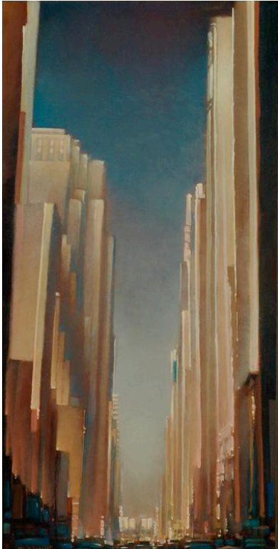
Formation , 2010, Oil on canvas, 24 x 12 in.

Vanishing points slip off-center, crowded out by buildings that curve overhead and sweep downward to street level, where human activity is reduced to blurs of light and movement.