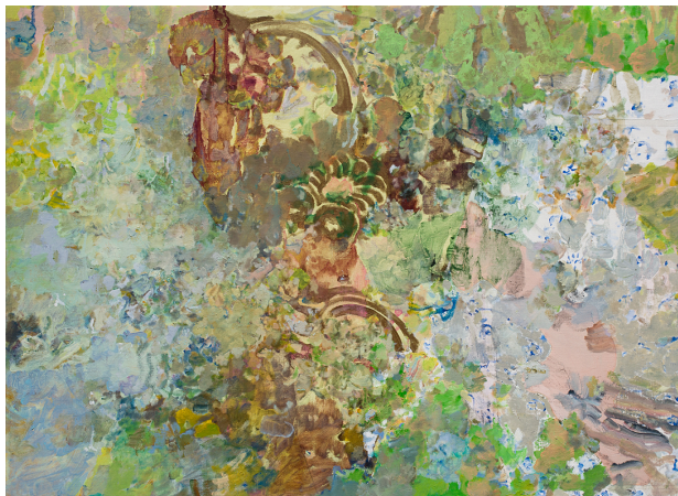
Rococo Spring , 1998. Oil on linen, 22 x 30 inches

This new approach of atmospheric mark making is reflected clearly in the suite of four paintings in the exhibition inspired by the changing seasons. Rococo Spring (1998), presents curvilinear shapes resembling a human head and flowers in the central part of the canvas, amassed by layer upon layer of saturated, opaque colors that burst off the composition. Blue Probes Winter (1998) is a symphonic haze of pink and blue, framed by swaths of deep yellow, with subtle hints of abstracted foliage visible throughout the canvas.