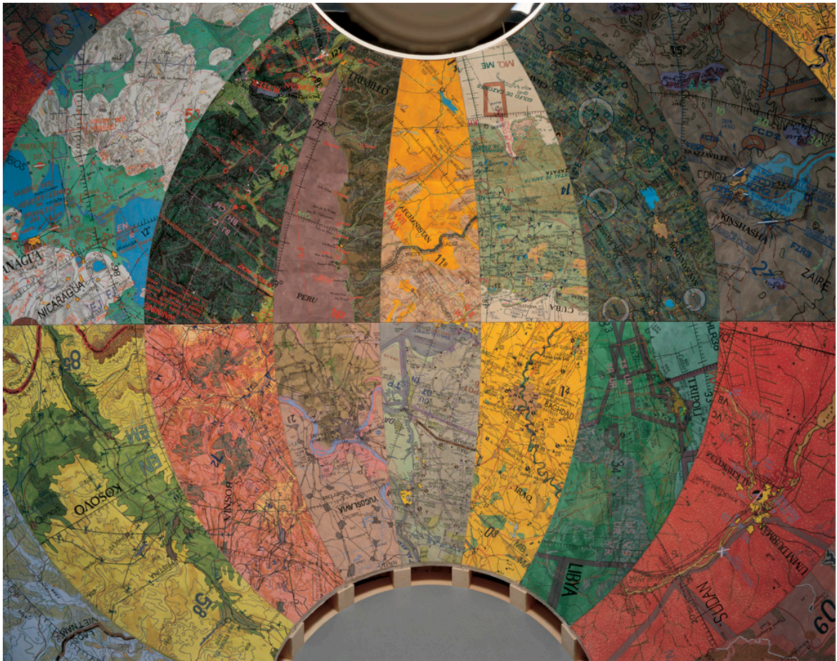
Interior View of Targets

Targets is an enormous walk-in globe with an open oculus at the top, in homage to the Pantheon, the second-century Roman temple and one of the city's great architectural treasures. The exterior is of plain, unpainted wood; step inside and one is engulfed by a vividly painted mosaic of map fragments. Shaped a bit like sections of an orange, each map is painted a different color. Some are inverted, so names must be read upside down. The feeling of disorientation is accentuated by a reverberating echo which amplifies and distorts any sounds originating from within the globe. Each section is based on a contemporary aeronautical chart of a country that the United States has bombed since 1945 – for example, Korea, Guatemala, Congo, Vietnam, El Salvador, Iraq, Libya, and Yugoslavia. It serves as a reminder of the impersonality of modern warfare, where places in which civilians work and live are abstracted into a set of sight lines and landmarks for the purposes of disengaged destruction."