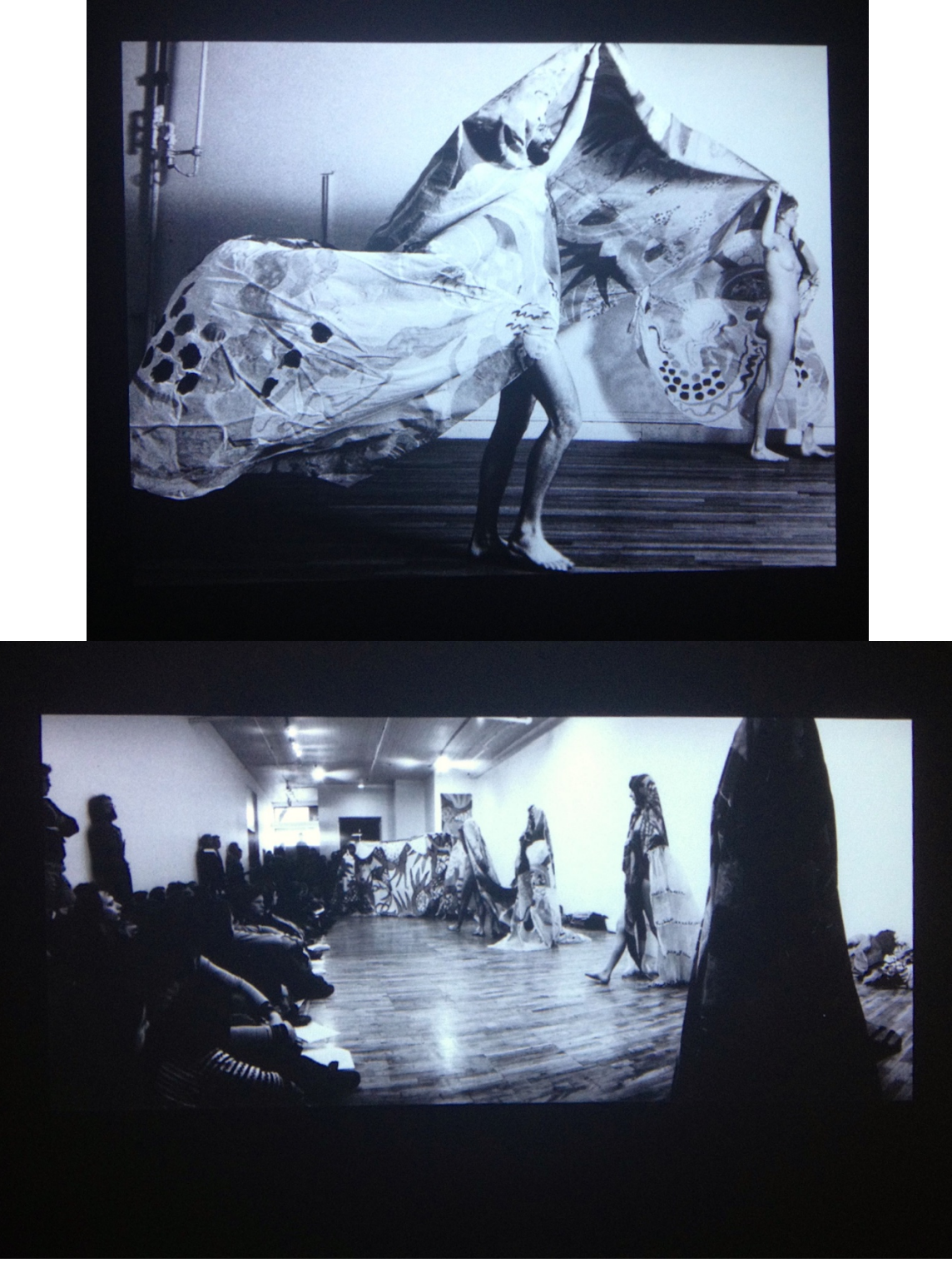
Video stills from Persian Line II (1976)

535 WEST 22ND STREET NEW YORK NEW YORK 10011 212 247.2111 DCMOOREGALLERY.COM