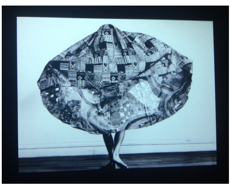
Video still from Persian Line II (1976)

In addition to Persian Line II , from 1970 to 1982, Robert Kushner spent time making body sculpture, called "costumes." Some were constructed of fresh food sewn to itself, or attached to crocheted garments of his own constructions, as well as repurposed garments, non-art/non-garment materials, perishables, and found objects. The costumes were presented in public performances. These pageants, fashion shows, and tableaux vivants were performed at various institutions and festivals such as The Museum of Modern Art, The Berliner Festwoche, The Vienna Performance Festival, The Kitchen, The Clocktower, The Philadelphia Institute of Contemporary Art, and as well as many galleries and other museums.