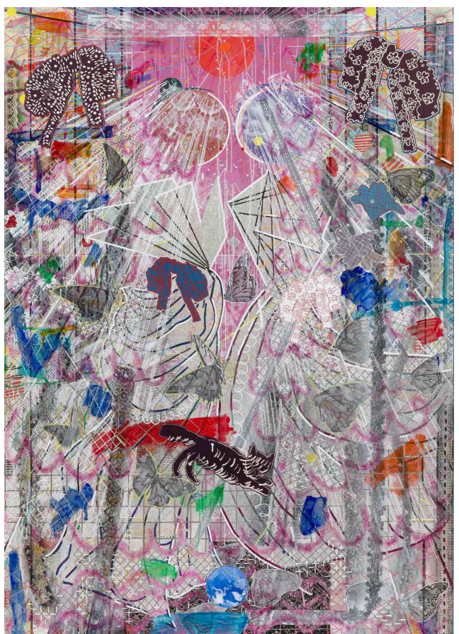
Brides (Hilary & Ara), 2021. Acrylic and mixed media on mulberry paper on wood, 84 x 60 in.

535 WEST 22ND STREET NEW YORK NEW YORK 10011 212 247.2111 DCMOOREGALLERY.COM