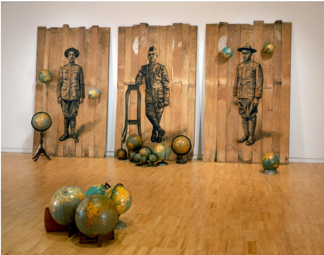
Autour Du Monde , 2008, Conté on wood panels with globes, 102 x 189 x 171 inches.

Lovell has long been intrigued by the theme of the African American servicemen, particularly during World War I and World War II, because of the irony inherent in Black men enlisting to fight for a country that did not afford them basic human rights. Despite hopes that demonstrating American patriotism would improve their status in the U.S., returning soldiers were met with violent conflict and continued oppression.