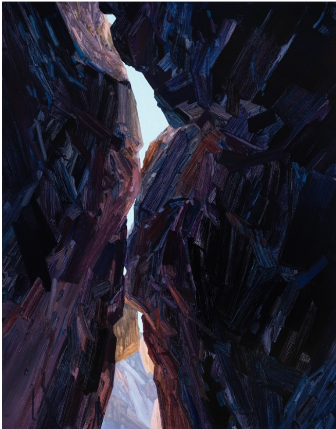
Canyon , 2024. Oil on canvas, 84 x 66 inches.