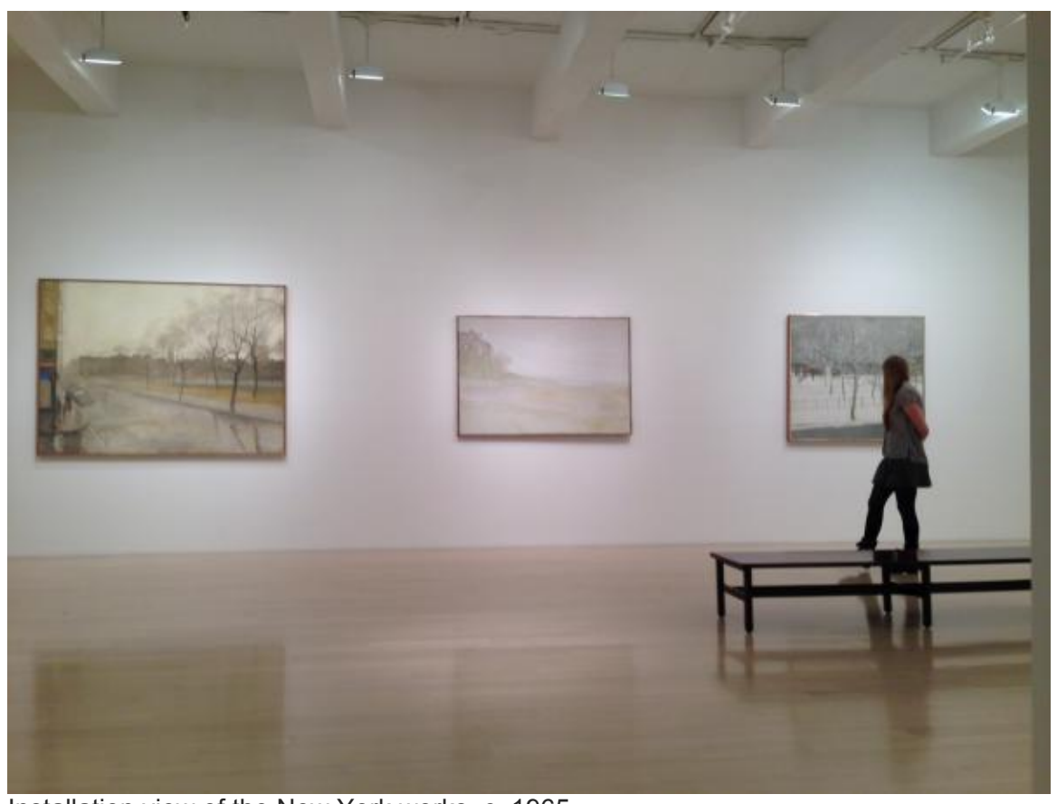
Installation view of the New York works, c. 1965 Jennifer Landes