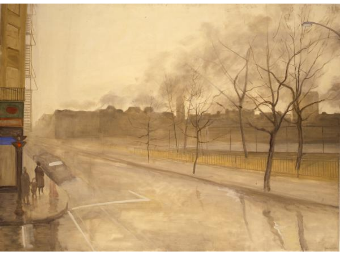
"Rain on Avenue B," 1965

As moody, evocative, and revelatory as those New York City landscapes are, they just don't come close to the full realization and maturity of these later works that give life and soul to the sky in a way that reminds us of the best of the atmosphere here, but always exceeds it, doing what some might call the ultimate creator one better.