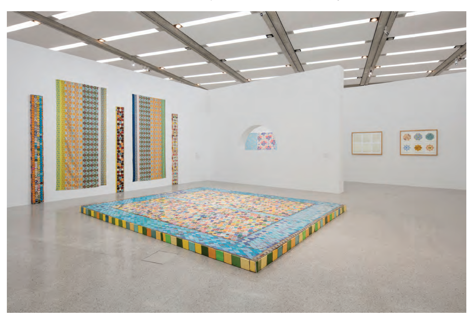
29. Installation view of Pattern and Decoration at MUMOK, Vienna, 23rd February-8th September 2019, showing An Interior Decorated, by Joyce Kozloff.

With a comparable scope, the catalogue is set to be a standard text on the subject. Holger Otten traces