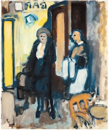
Still Life, circa 1946, and Anna Christie Entering the Bar, 1976, by Robert De Niro Sr.