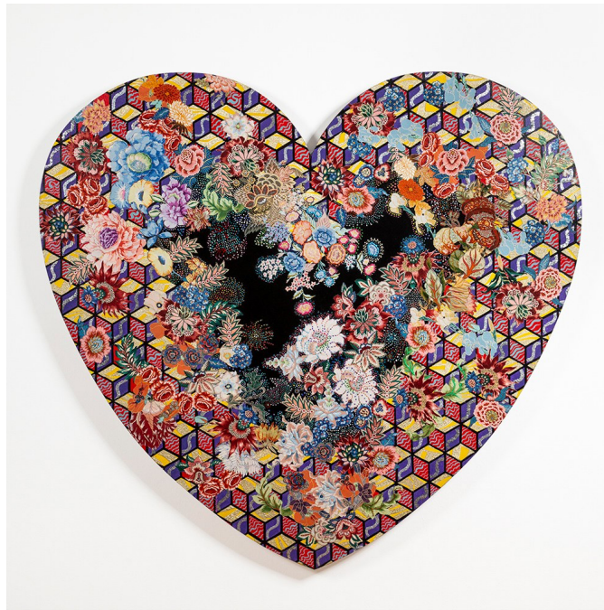
One of Miriam Schapiro's femmage hearts, the 1985 work Heartland .

“But let me say this,” Katz stresses. “The most interesting way to figure out how we got to our present moment—with its meteoric rise of ceramics, unabashed decorative and maximalist sensibilities, and high number of artists who are appropriating craft and craft traditions—is to look at the influence of pattern and decoration.” A women-centric north star, it would seem.