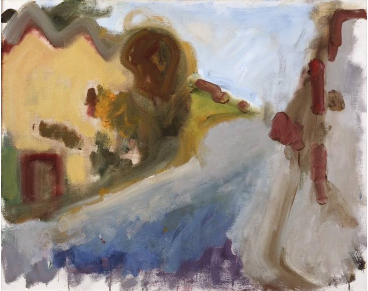
Robert De Niro – Landscape with Road, n.d. Oil on canvas, 27 1/4 x 34 1/4 inches