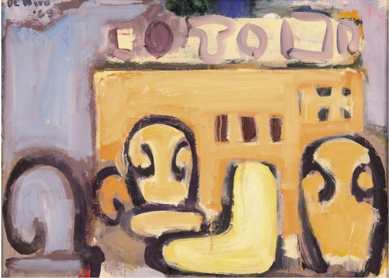
Robert De Niro – Interior with Still Life and Chairs, 1969. Oil on masonite, 21 3/4 x 30 inches