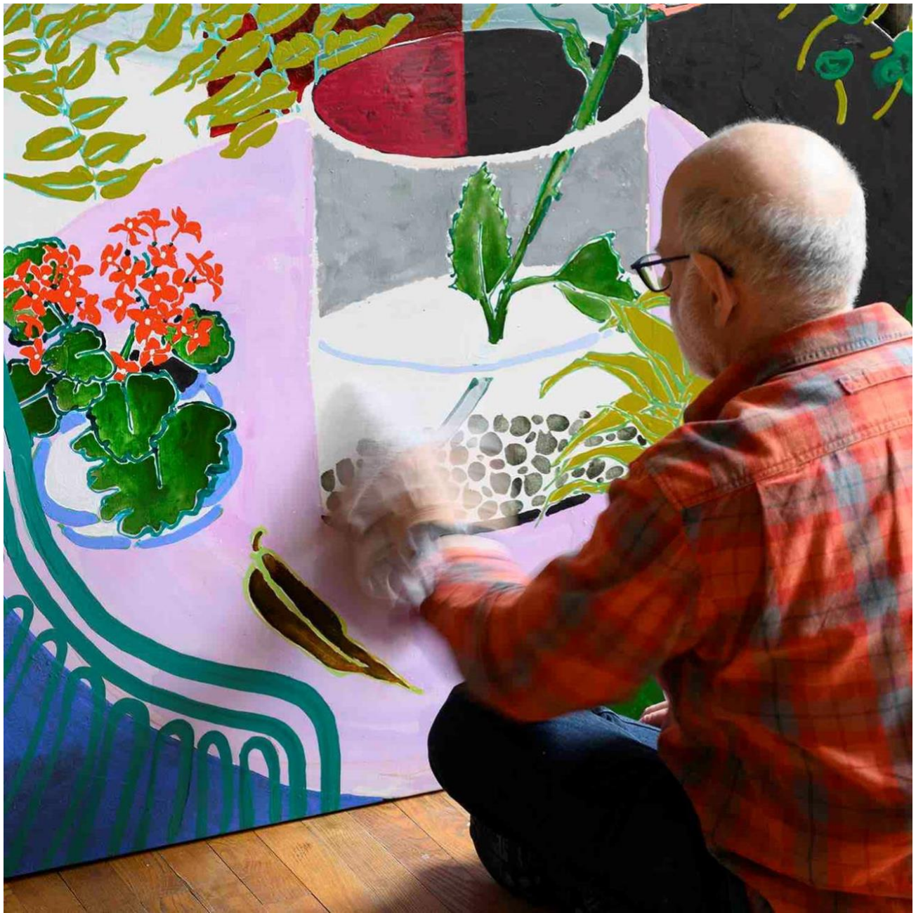
Robert Kushner painting Matisse Table , 2020. Oil and acrylic on canvas, 48 x 48 inches.