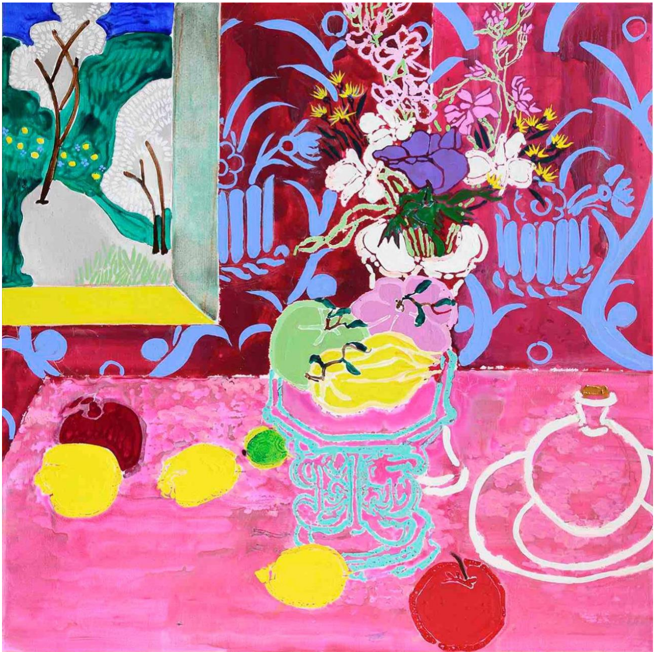
Red Room , 2020. Oil and acrylic on canvas, 48 x 48 inches