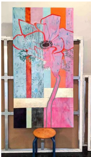
One Red Anemone , 2020. Oil, acrylic, and gold leaf on canvas, 72 x 36 inches

During the dark, cold gray winters, instead of going in the Vilhelm Hammershøi direction of silvery light and cool gray tonality, I summon in my mind the blinding light of the South of France. I remember being a student of the Master, watching him daily in awe, as I am now squeezing the entire world of color onto my palette and then letting it sing on the canvas. In my attic studio, I am carefree, wild, experimental, intoxicated by color harmonies and the sun-drenched tranquility and protection of being in the South of France. Or is it the South of California? The Mediterranean plants, the fruit, the vases, the fabrics... and that is what keeps going on in my head.