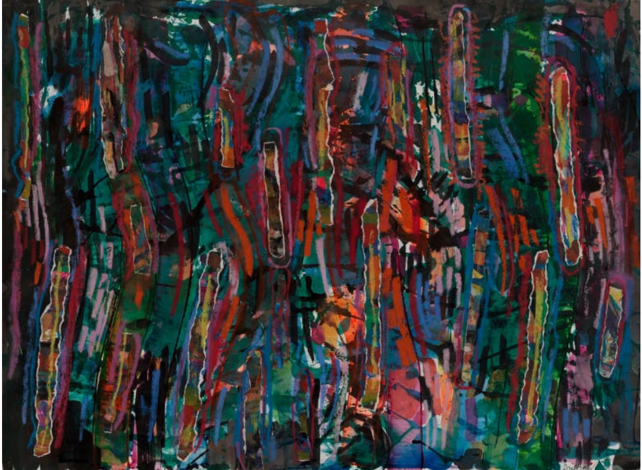
David C. Driskell - Flowing Like a River, 1996–97 Collage and gouache on paper. Pennsylvania Academy of the Fine Arts, Philadelphia. Caroline Thomas Fund and Harold A. and Ann R. Sorgenti Fund for African-American Art, 2005.20