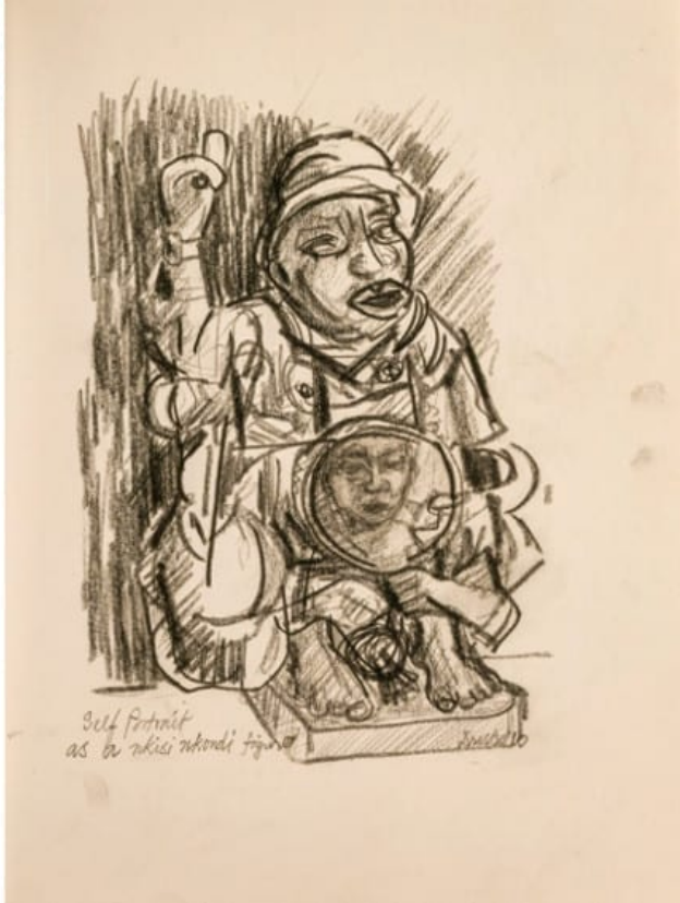
Left: David C. Driskell - Young Pines Growing, 1959. Oil on canvas. Clark Atlanta University Art Museum, John Hope Franklin Purchase Award. / Right: David C. Driskell - Self-Portrait as Nkisi Nkondi Figure, 2010. Graphite, charcoal and mixed media, collection of the artist.