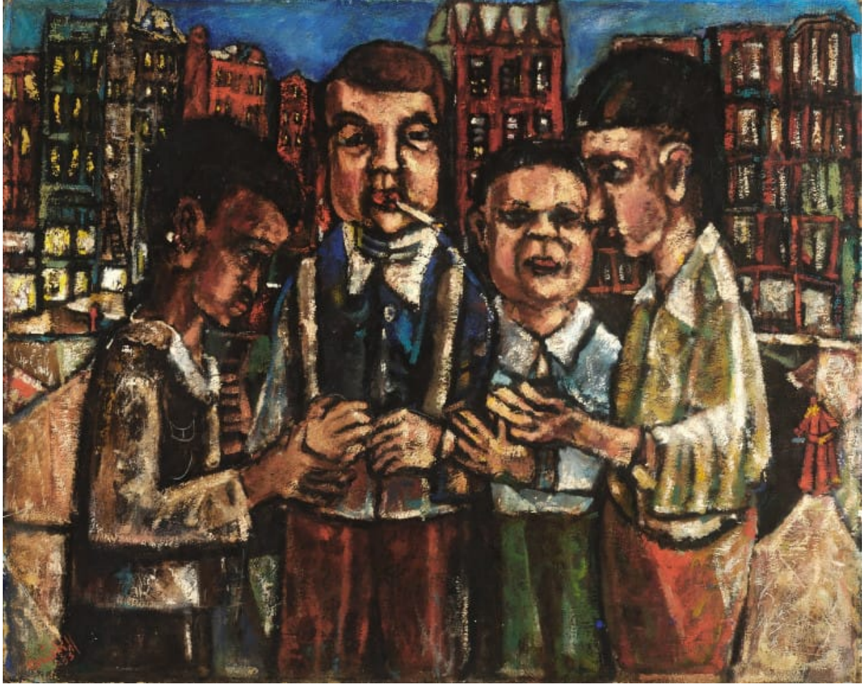
David C. Driskell - City Quartet, 1953, oil on canvas, University of Maryland.