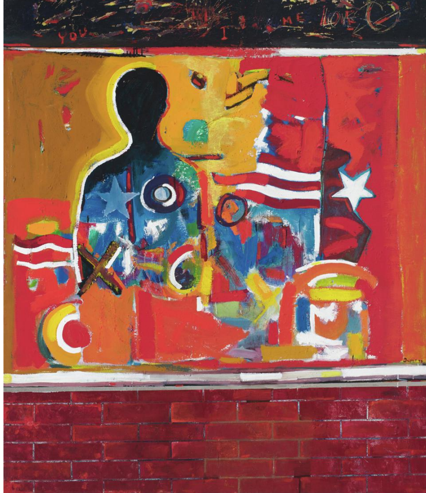
David C. Driskell (American, 1931–2020), Ghetto Wall #2 , 1970 Oil, acrylic, and collage on linen 60 ... [+]