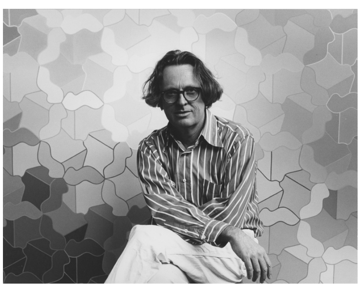
George Woodman, c. 1975.

By the 1960s, Woodman's abstract paintings had developed into mathematical and precise compositions balancing line, shape, and form, creating formally inventive tessellations with a complex understanding of color. Woodman continued his systematic approach to painting until the 1980s, when he turned toward classical figuration in both his painting and his reignited photography practice, which featured large format black and white photographs of nudes in classical architectural and sculptural settings.