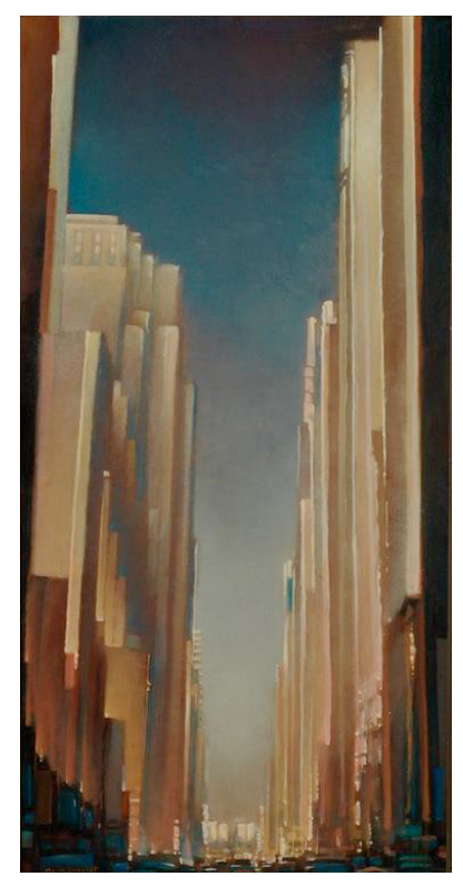
Formation, 2010, Oil on canvas, 24 x 12 in.

Vanishing points slip off-center, crowded out by buildings that curve overhead and sweep downward to street level, where human activity is reduced to blurs of light and movement.