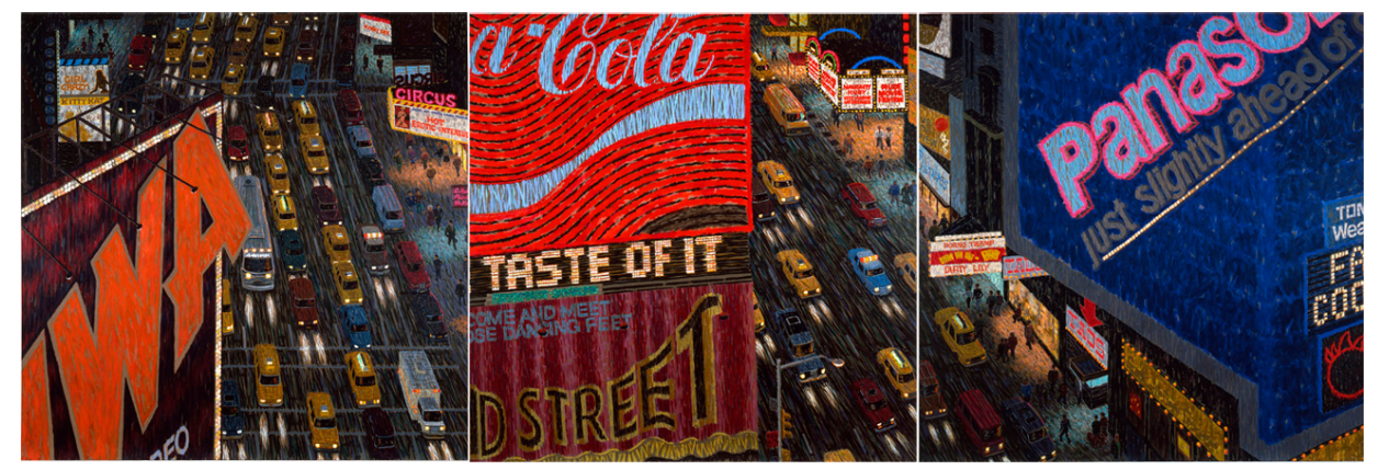
Yvonne Jacquette, Times Square Triptych II, 1986-87. Oil on canvas, 80 x 80 in. each.

September 6 – 29, 2012 Opening Reception: Thursday, September 6, 6 – 8 pm