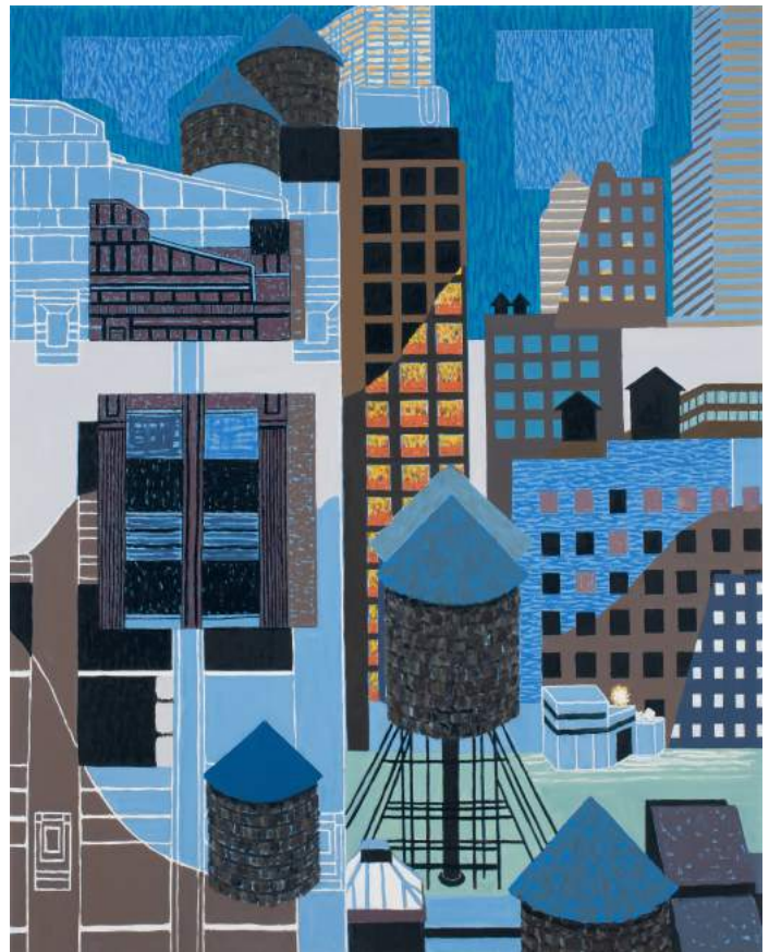
New Highrise Hotel, Old Chelsea , 2014. Oil on canvas, 42 ¼ x 33 ½ in.