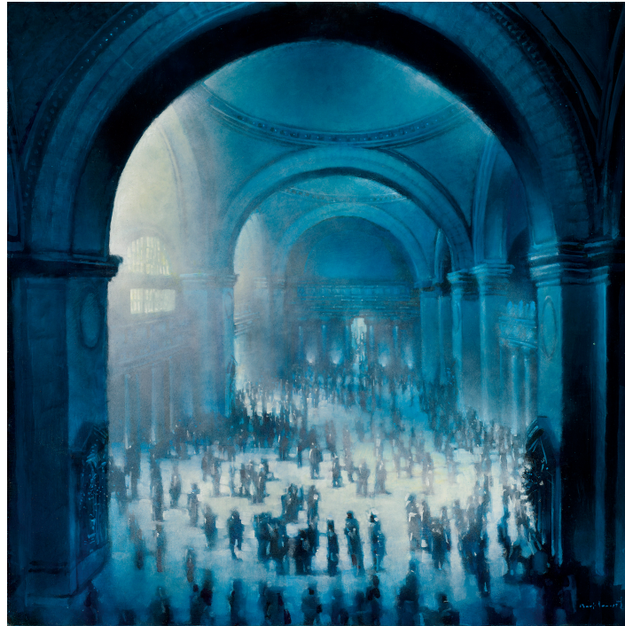
Met Museum Interior , 2018. Oil on canvas, 30 x 30 inches.

Opening reception with the artist Thursday, January 31 st , 6-8pm