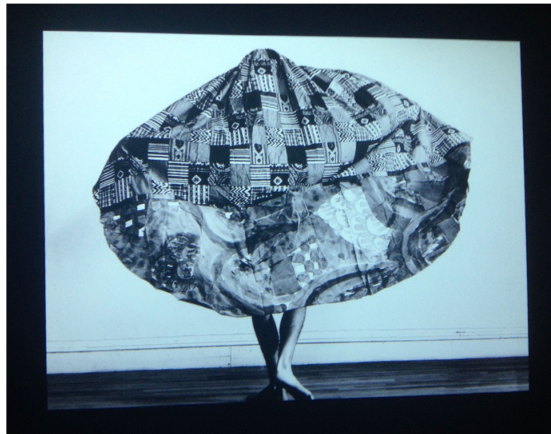
Video still from Persian Line II (1976)

In addition to Persian Line II , from 1970 to 1982, Robert Kushner spent time making body sculpture, called "costumes." Some were constructed of fresh food sewn to itself, or attached to crocheted garments of his own constructions, as well as repurposed garments, non-art/non-garment materials, perishables, and found objects. The costumes were presented in public performances. These pageants, fashion shows, and tableaux vivants were performed at various institutions and festivals such as The Museum of Modern Art, The Berliner Festwoche, The Vienna Performance Festival, The Kitchen, The Clocktower, The Philadelphia Institute of Contemporary Art, and as well as many galleries and other museums.