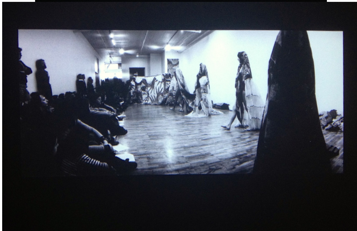
Video stills from Persian Line II (1976)