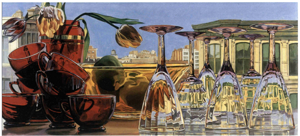
Janet Fish, Red Cups and Tulips, 1981. Oil on canvas, 36 x 82 inches

Over the last fifty years, Janet Fish has drawn on her embrace of change and belief in the underlying interconnectedness of objects to fuel her remarkable painting practice. The objects she selects serve as armatures for the exploration of color and light, and exuberantly articulate states of flux. Her paintings are an unending formal experimentation and mastery of multiple genres. Though she works against the idea of capturing a photographic moment, she succeeds in preserving a mood, quality of light, and sense of place to which the viewer can continually return to. The exhibition will showcase works created from the 1980s-early 2000s.