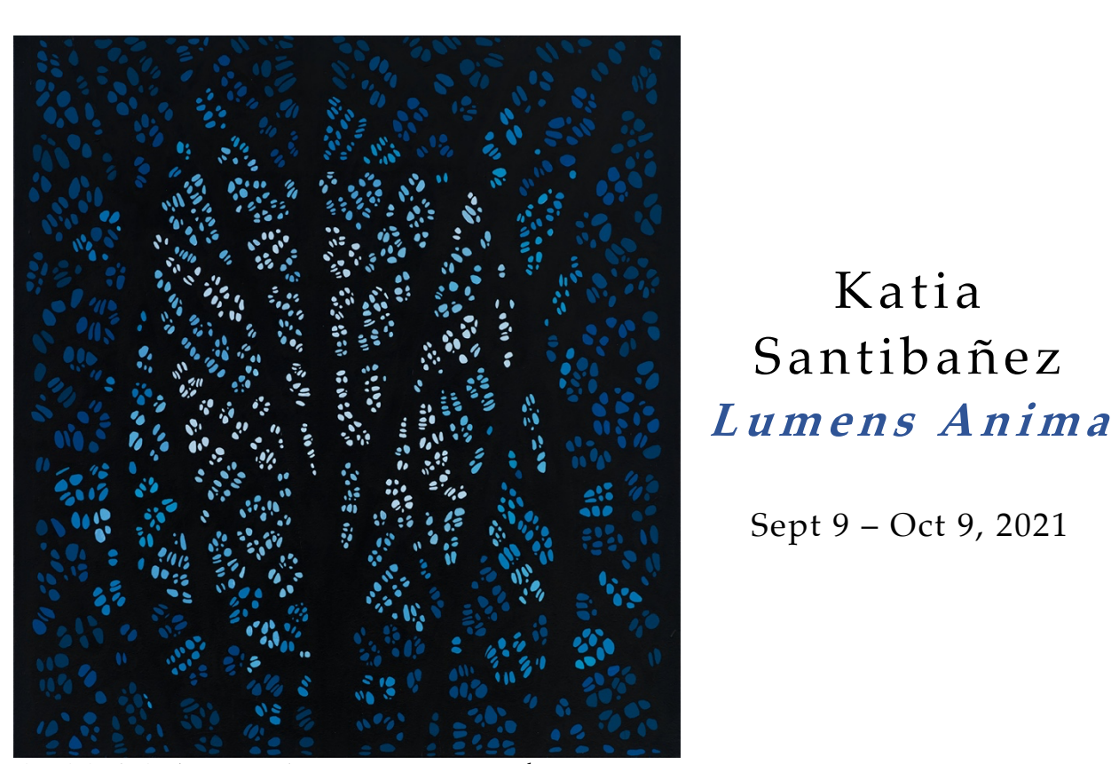
The Delight of Solitude, 2020. Acrylic on canvas, 29.75 x 27.5 inches

535 WEST 22ND STREET NEW YORK NEW YORK 10011 212 247.2111 DCMOOREGALLERY.COM