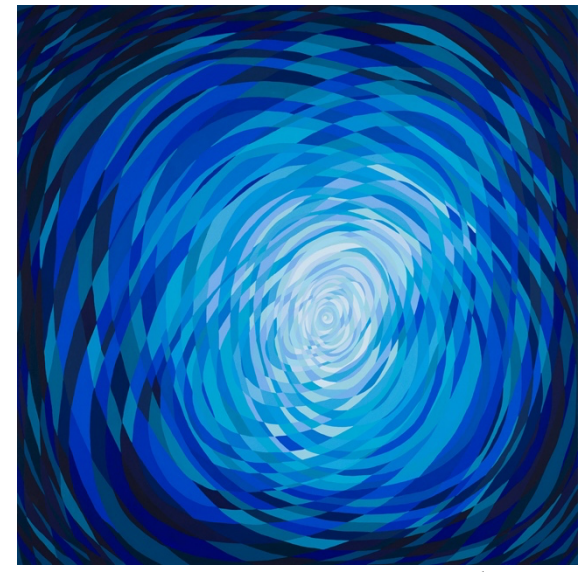
A Secret Field, 2021. Acrylic on canvas, 51 x 51 inches

Katia Santibañez is an American artist, born in France. She studied painting at Ecole Nationale Superieure des Beaux Arts. She has been in residencies at Yaddo, NY; Casa Wabi, Mexico; The Albers Foundation, CT; Sitka, OR; and Civitella Ranieri, Italy. Her work has been collected internationally and is in both private and public collections including The Albright-Knox Art Gallery, Buffalo, NY; The Bibliotheque Nationale de Paris, France; Mount Holyoke College Art Museum, Massachusetts; The Morgan Library and Museum; The Museum of Modern Art; and The Metropolitan Museum of Art, New York, NY. The artist lives and works in Otis, Massachusetts and New York, NY.