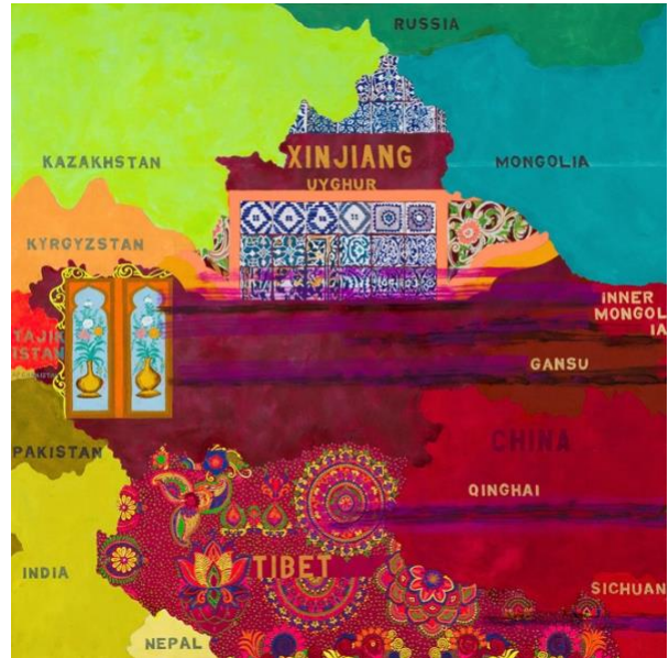
Both 2022-23, acrylic on canvas, 60 x 60 inches. Left to right: Sudan, Xinjiang Tibet